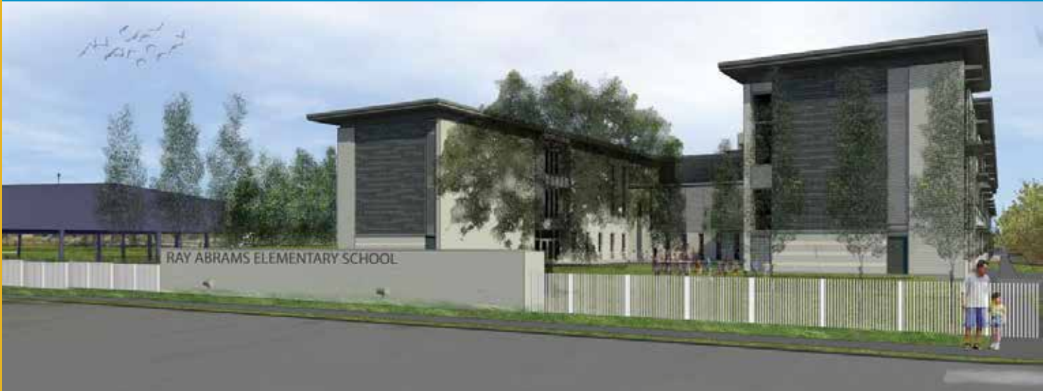
Ray Abrams Elementary School