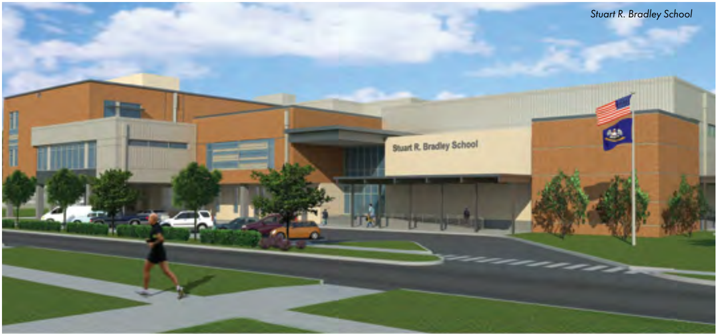
Stuart R. Bradley School