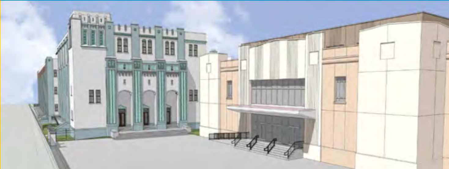
McCain Secondary School