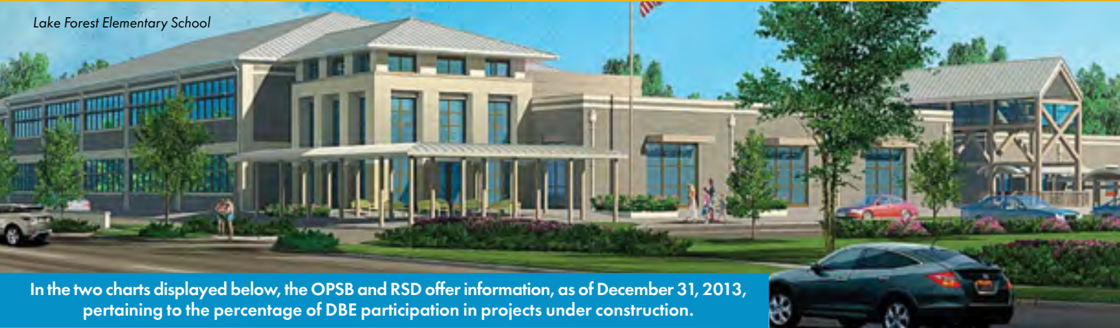
Lake Forest Elementary School

In the two charts displayed below, the OPSB and RSD offer information, as of December 31, 2013, pertaining to the percentage of DBE participation in projects under construction.