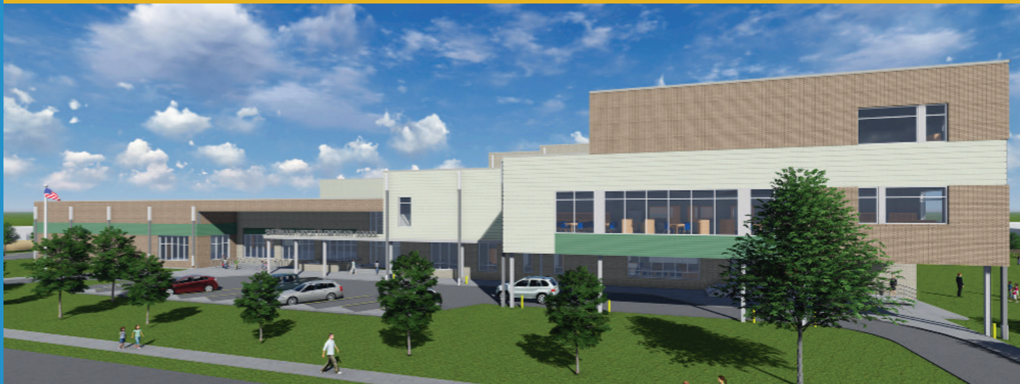
Sherwood Forest School