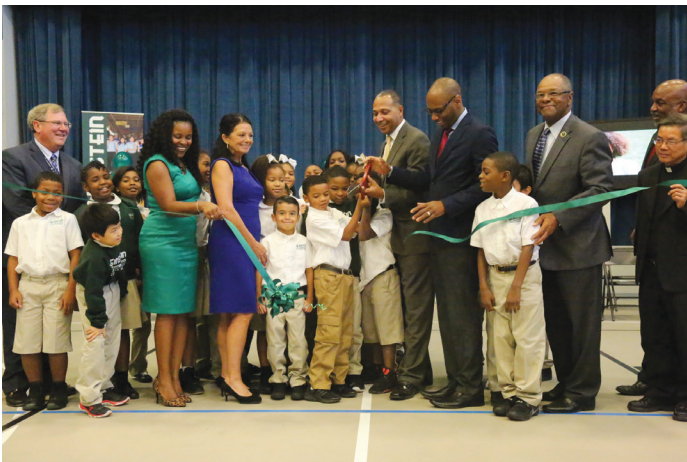
Sherwood Forest Elementary School