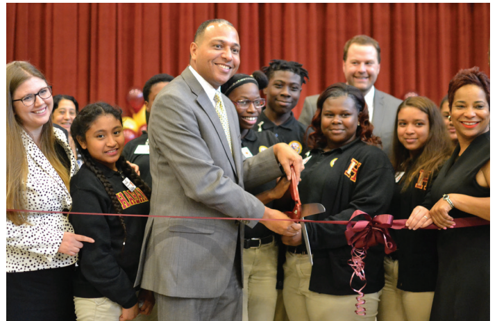
Paul B. Habans Elementary School

November 2, 2016 – totaling $243.7 Million in construction projects.