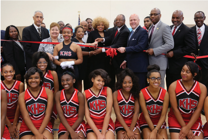
Dr. Martin Luther King, Jr. High School