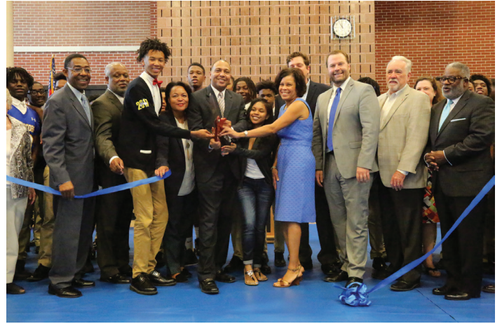
Sophie B. Wright High School