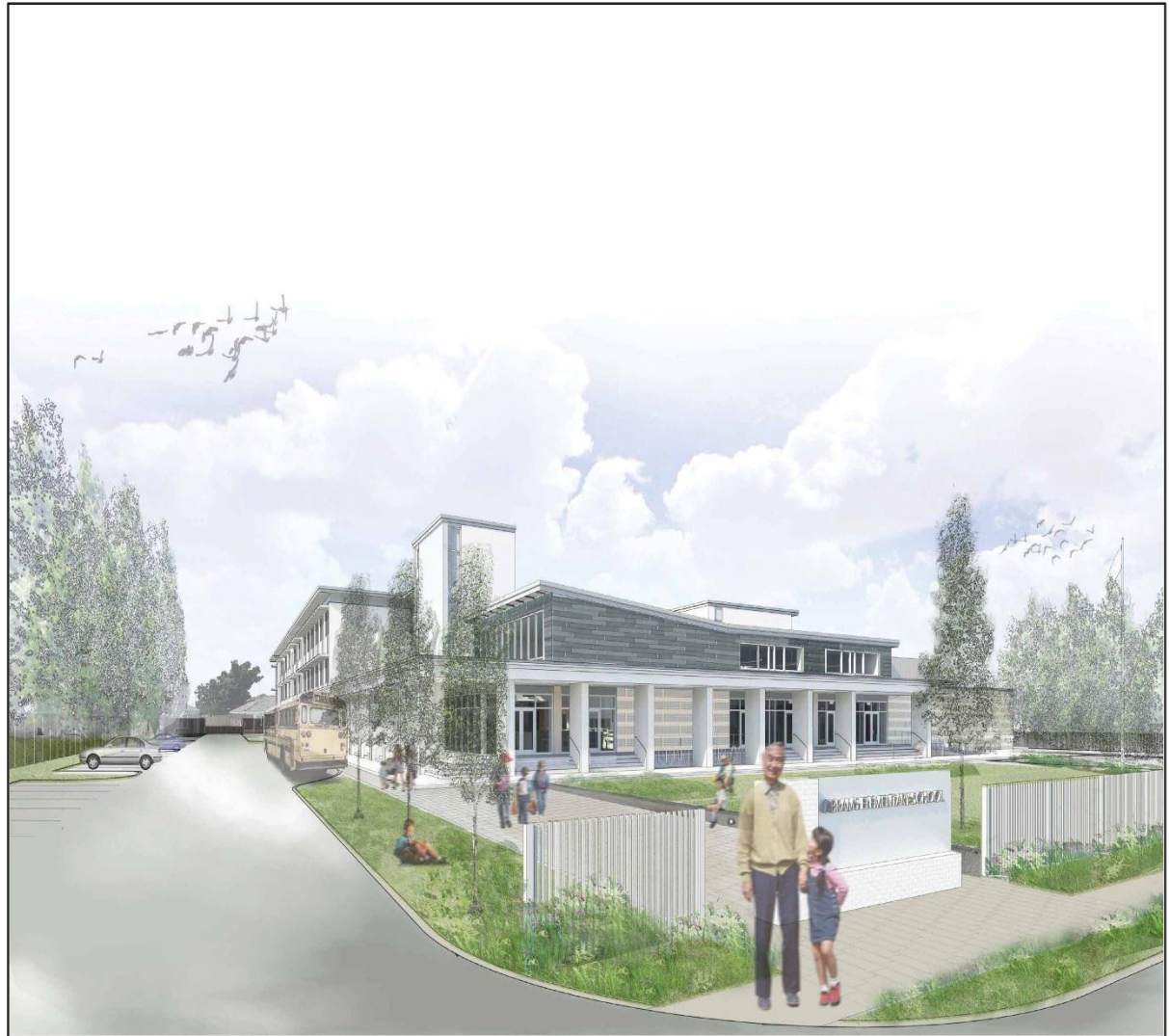
Waggonner & Ball Architects RAY ABRAMS ELEMENTARY SCHOOL RSD ABRAMS SCHOOL