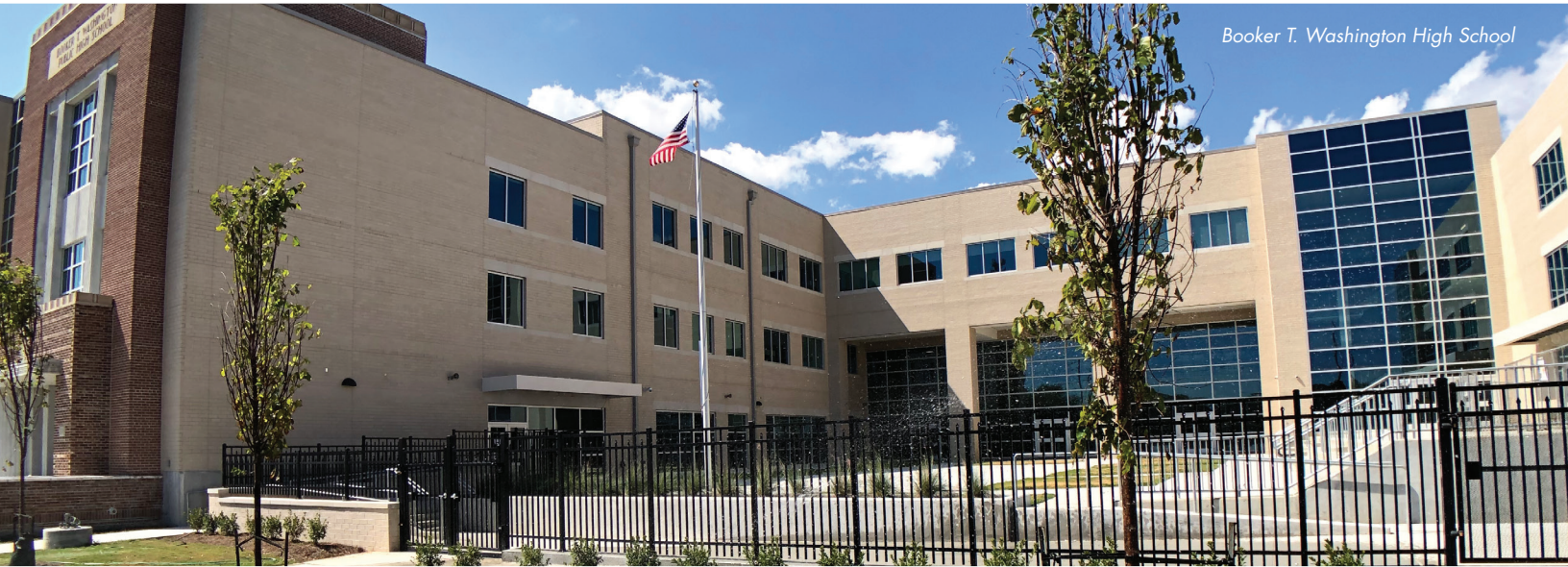
Booker T. Washington High School

Schools Rebuilding DBE Newsletter • February 2020