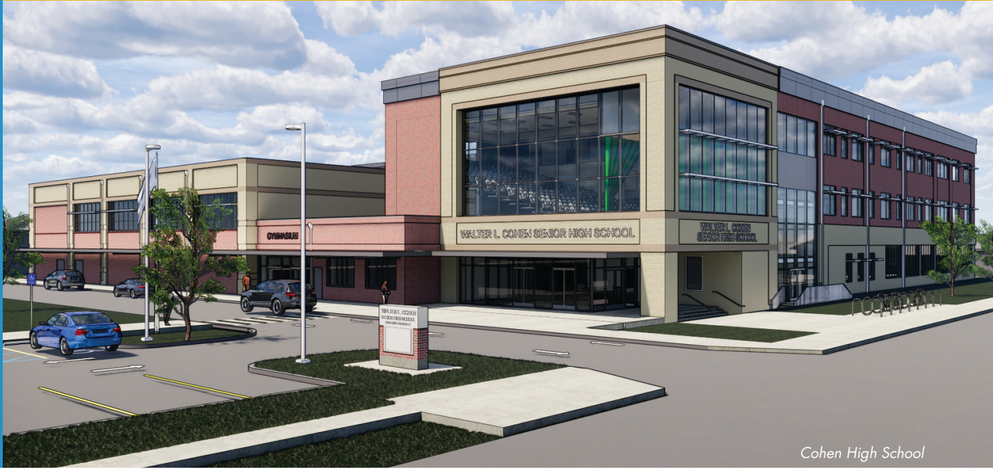
Cohen High School