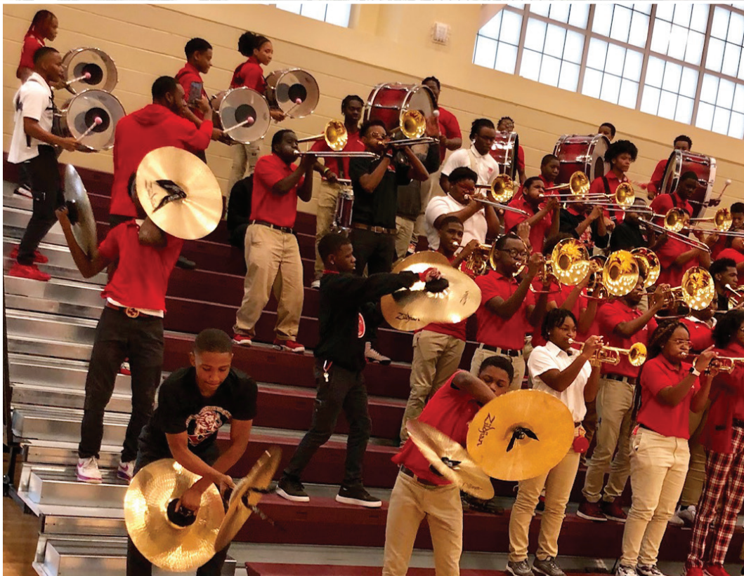
Booker T. Washington High School ribbon cutting celebration

As we approach the 15 year anniversary of the devastation caused by Hurricane Katrina, the Recovery School District (RSD) is pleased to report that the rebuilding of the New Orleans Public Schools is nearing a completion of the Master Plan developed following the storm. Of the seventy-nine (79) schools designated to be rebuilt new, renovated or refurbished, seventy-three (73) projects have been completed.