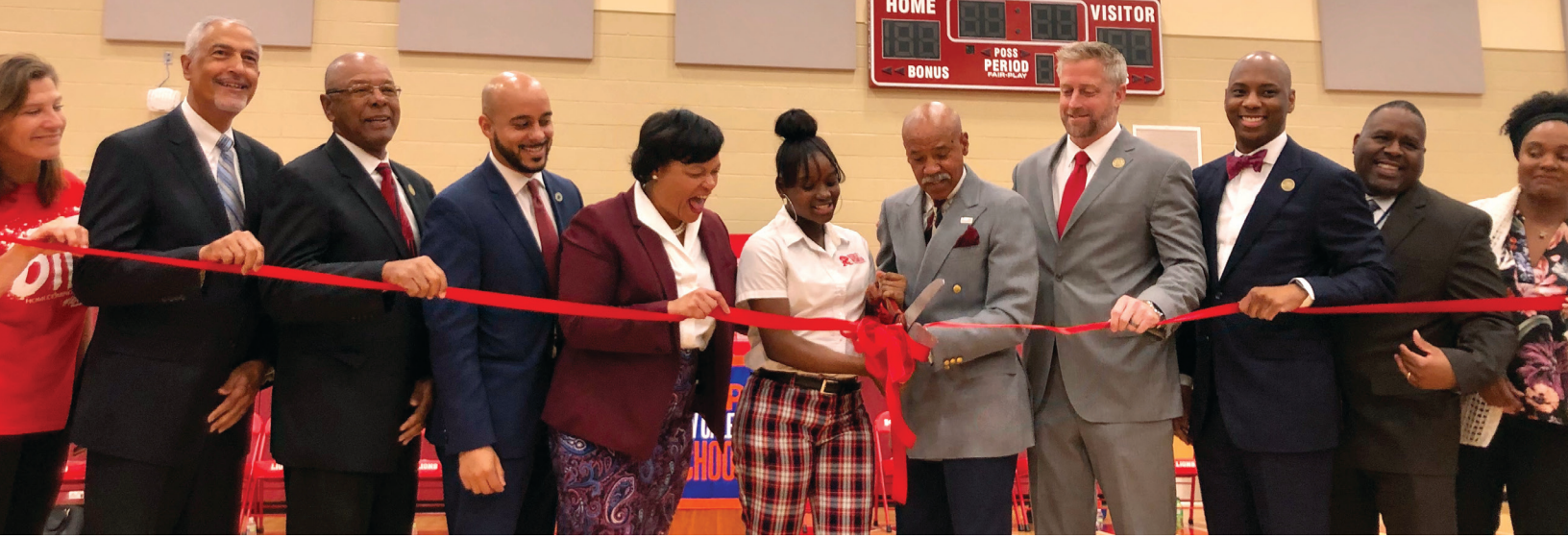
Booker T. Washington High School ribbon cutting

Additionally, approximately 3.5 million square feet of storm damaged buildings have been demolished. Nine (9) buildings have been “moth-balled” to US Department of Interior standards and twenty-eight (28) vacant buildings and unused parcels have been sold generating twenty-five million dollars ($25 million) for the Master Plan effort.